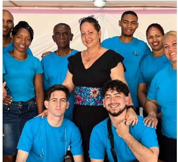
Año de abrir Pozos donde fluyan las Aguas del Espíritu.

As this document takes shape, we are turning the corner into February and already the challenges that lay ahead of us and the unstoppable movement of the Kingdom of God have been evident in the first weeks of this year.